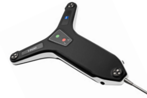
ZEISS T-POINT Hand-held touch probe for single points