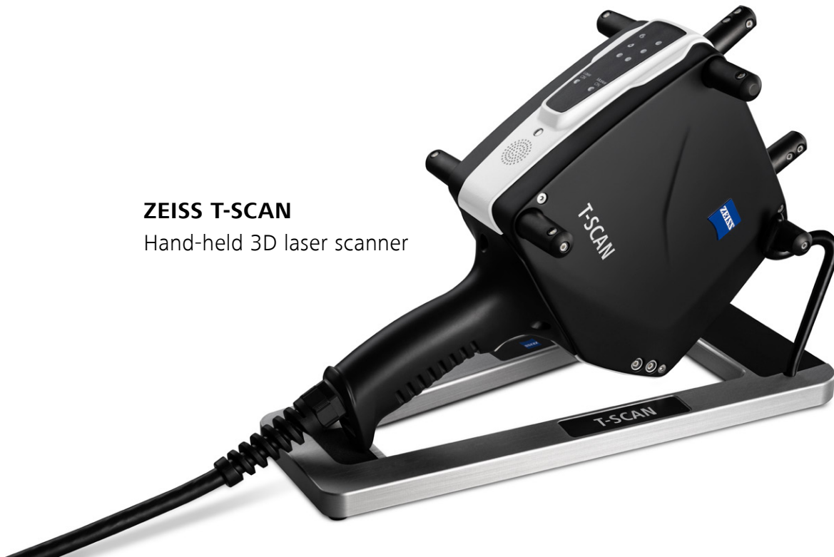
ZEISS T-SCAN Hand-held 3D laser scanner

Combine a hand-held laser scanner and a touch probe with the optical tracking system of your choice: the established ZEISS T-TRACK 20 for large measuring volumes of up to 20 m 3 or the new ZEISS T-TRACK 10 for a smaller measuring volume and higher accuracy.