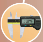
GAUGE PORT 3