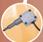
GAUGE PORT 1