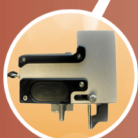
GAUGE PORT 2